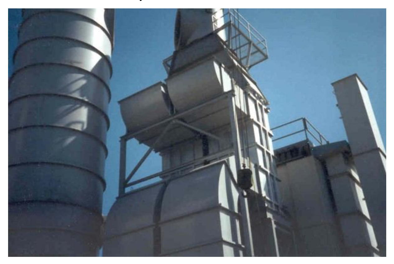
7.0' Diameter Dryer Soil Remediation Plant, Light Oil Contaminated Soil