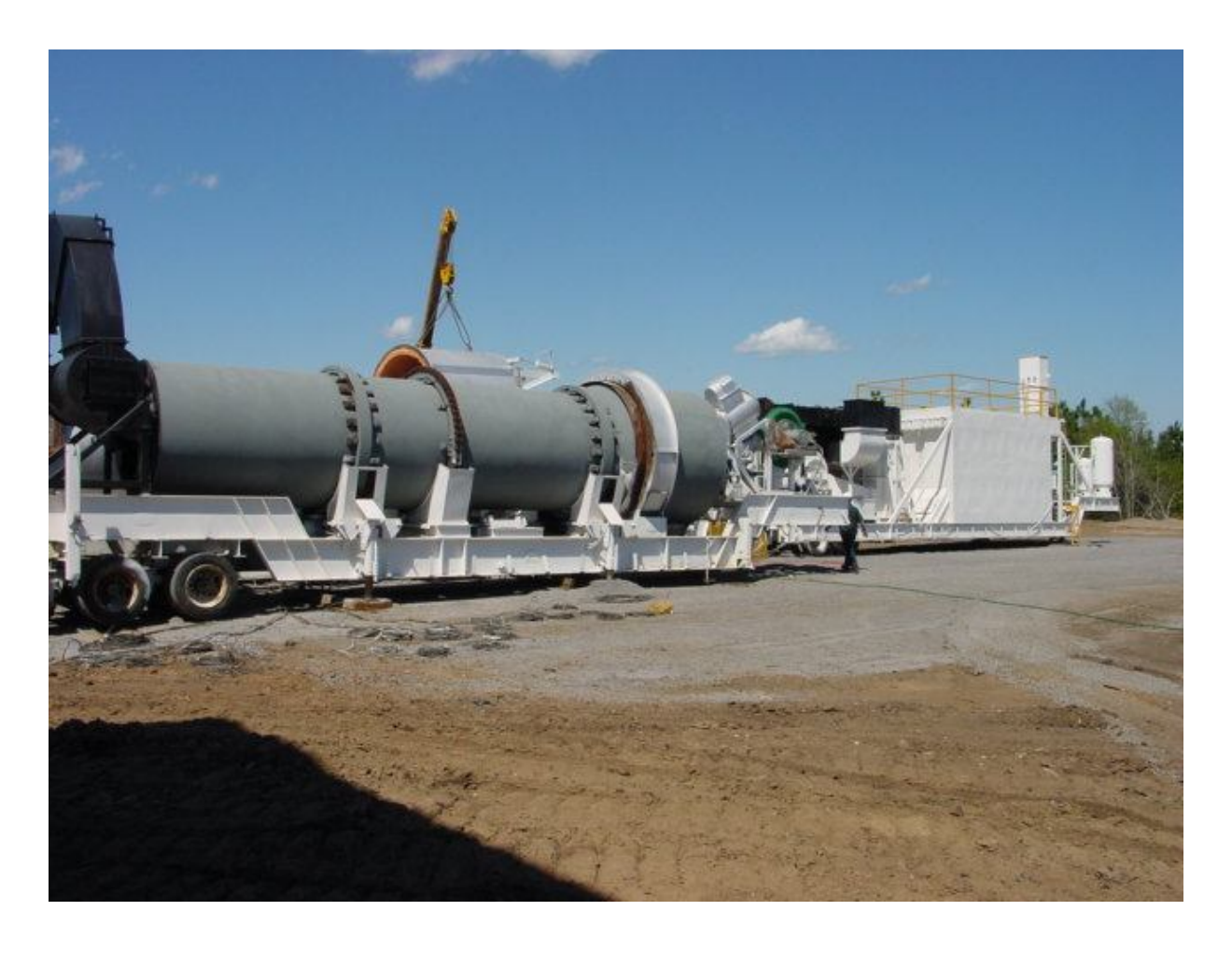
7.0' Diameter Dryer Soil Remediation Plant, Heavy Oil Contaminated Soil