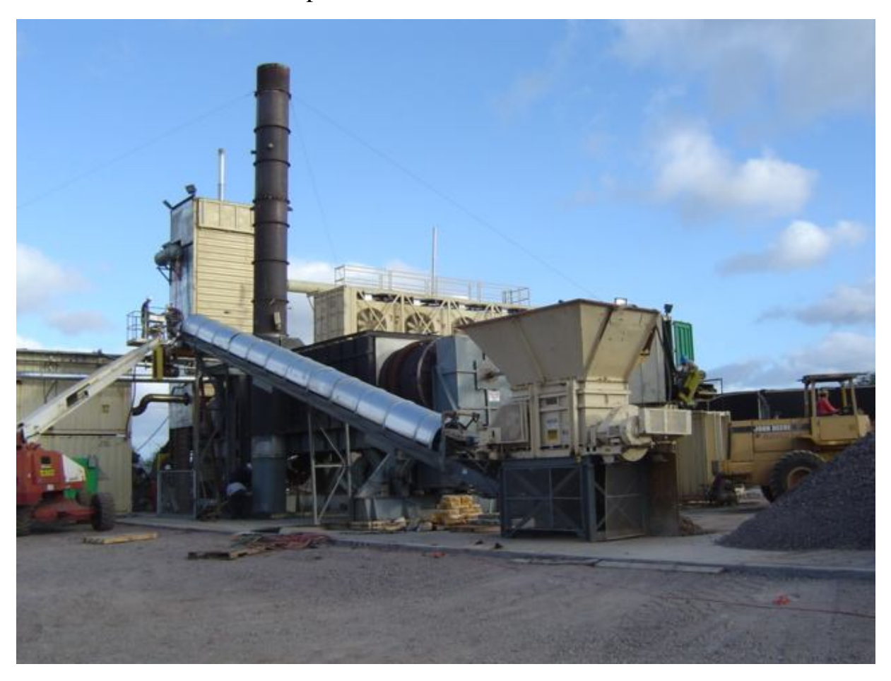
7.0' Indirect Fired Dryer, Triple Shell, Gas Condensing System

7-Foot Diameter Indirect Triple Shell Plant, Hawaii, USA