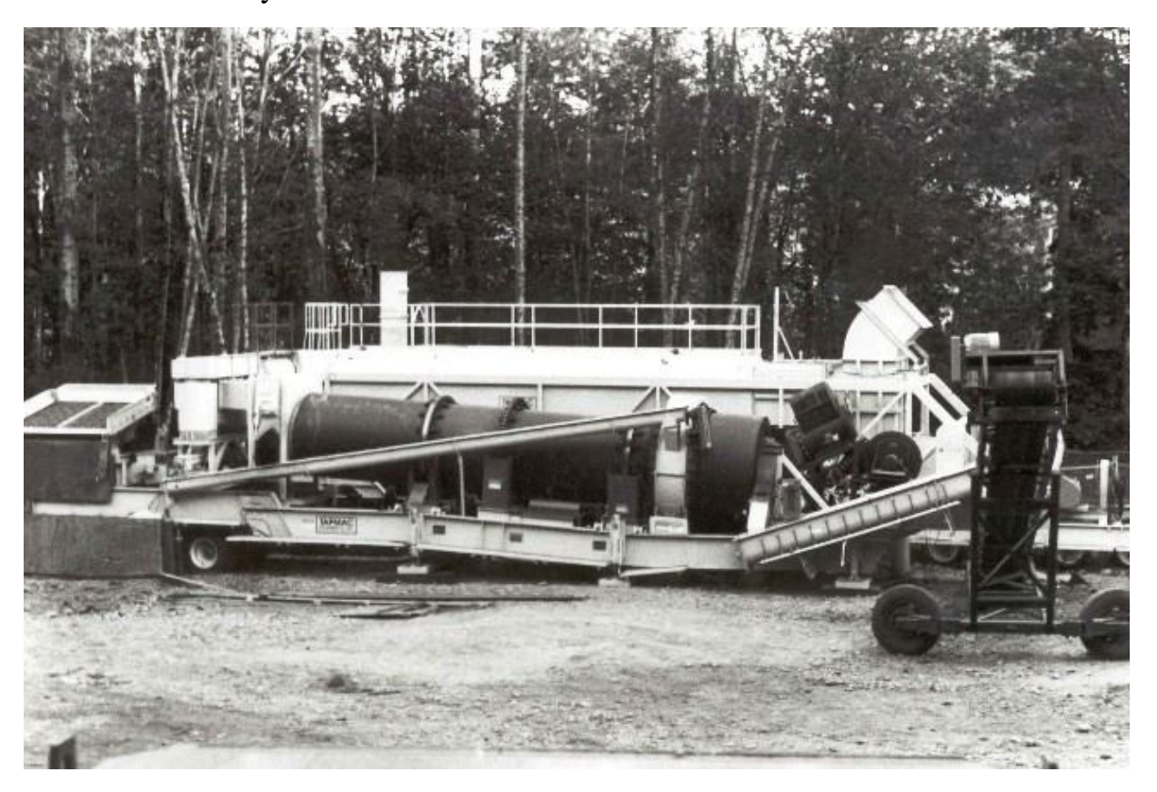
5.5' Diameter Dryer Soil Remediation Plant, Heavy Oil Contaminated Soil Capable. Feed Bin, Dryer, And Soil Conditioner On First Load. Oxidizer, Heat Exchanger, Baghouse On Second Load. Highly Portable