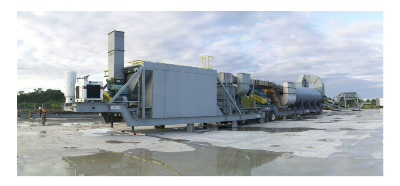
Super 7' diameter dryer soil remediation plant, heavy oil contaminated soil capable, chlorine and sulfur gas reduction equipment

Super 7-Foot Diameter Dryer Soil Remediation Plant