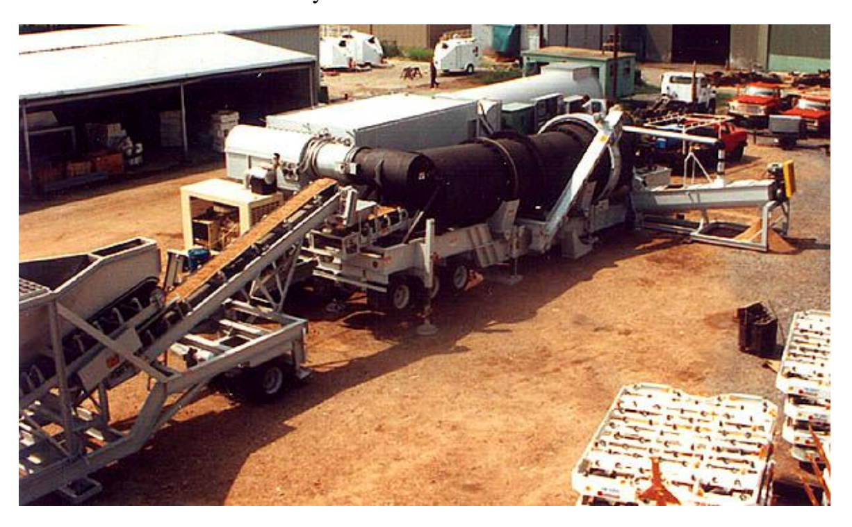
Standard 7-Foot Diameter Dryer Plant

7.0' diameter dryer soil remediation plant, light oil contaminated soil