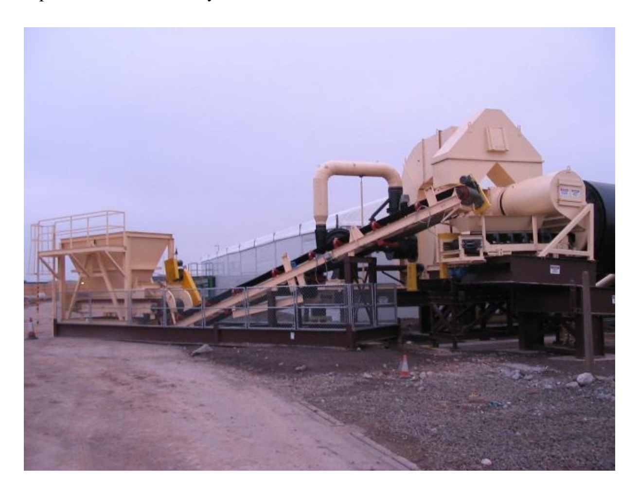
Super 7' Diameter Dryer Soil Remediation Plant, Heavy Oil Contaminated Soil Capable, Chlorine and Sulfur gas Reduction Equipment