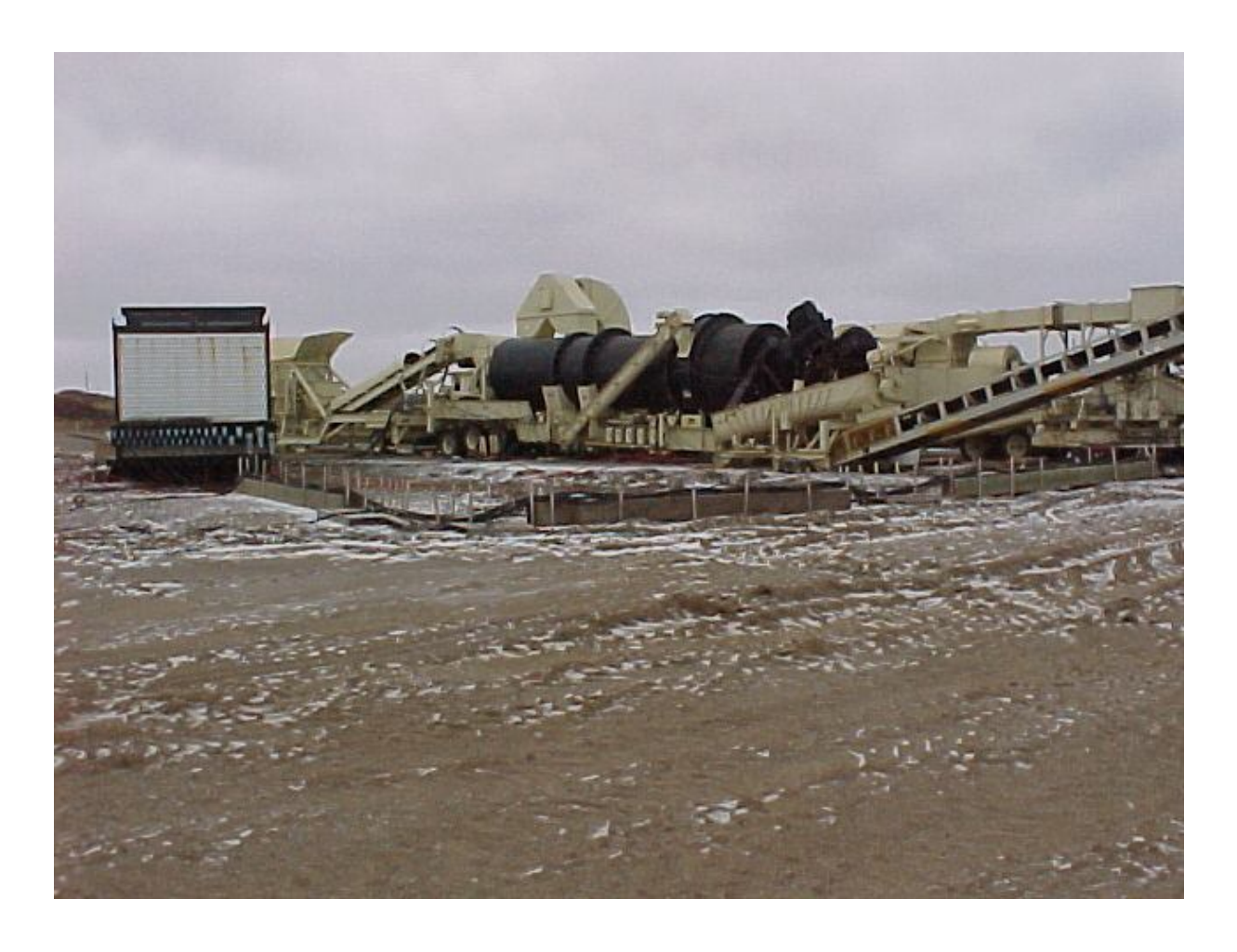
7.0' Diameter Dryer Soil Remediation Plant, Heavy Oil Contaminated Soil