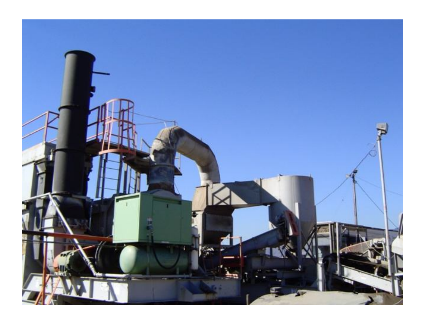
Super 7-Foot Diameter Soil Remediation Plant