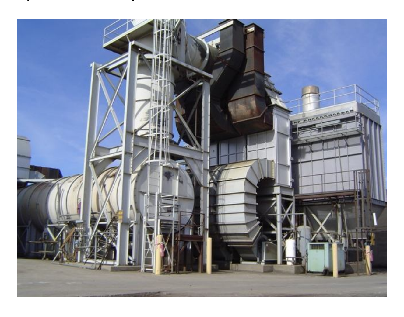
Super 7-Foot Diameter Dryer Soil Remediation Plant